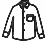
LONG SLEEVE OXFORD