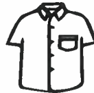
SHORT SLEEVE OXFORD