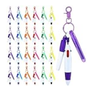
Retractable pen sets