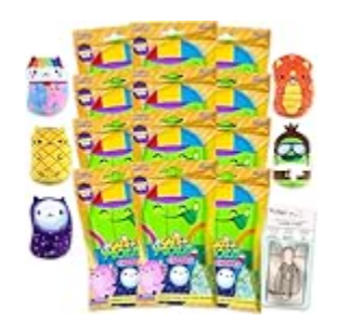
Cats vs. Pickles Mystery Bag