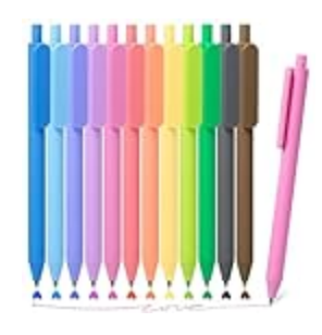
Pack of gel pens