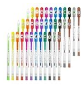
Scented Gel Pens