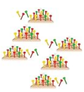
Wooden peg puzzles